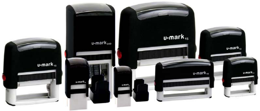
Precision crafted u•mark self-inking stamps

u•mark self-inkers are designed to work as great as they look. The ergonomic shapes, soft rubber feel and smooth action make them easy to operate.